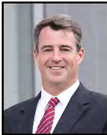
DOUGLAS F. GANSLER MARYLAND ATTORNEY GENERAL

MARYLAND ATTORNEY GENERAL'S OFFICE REPORT NOVEMBER 12, 2014