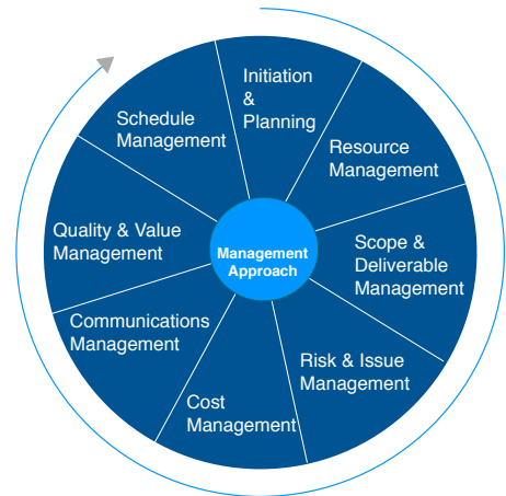
Figure 2: Monitoring Management Approach

The RBG team’s management approach is designed to enhance efforts to effectively plan, manage, and execute monitoring projects. The management approach includes mechanisms that facilitate efforts to further effective governance, optimize engagements, and strengthen communication. The team’s management approach delivers a repeatable set of rules that enforce effectiveness and accountability. As Figure 2 illustrates, the team management approach offers an integrated set of practices designed to keep the project on track and deliver the intended outcomes and benefits on time, within budget, and compliant with all of the requirements articulated by the client.